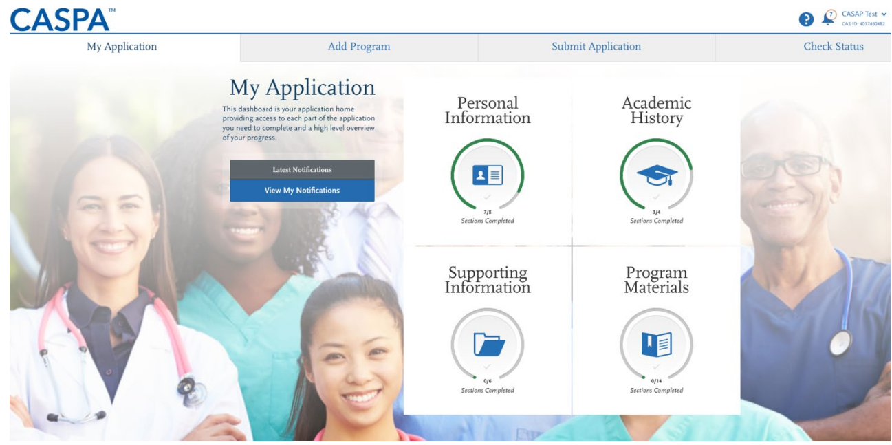
A snapshot of the application dashboard homepage

You may also access your applicant profile, the CASPA help center, apply for a fee waiver, add and remove programs, submit the application, check the status of application documents, and see notifications from Liaison, all from the dashboard.